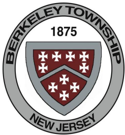
Mayor Carmen Amato